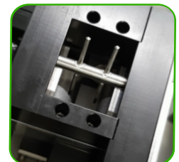
ANTI - CLOGGING SYSTEM