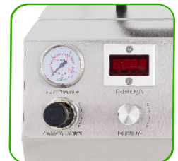
PRESSURE CONTROL, DRY ICE CONSUMPTION CONTROL