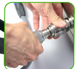
STAINLESS STEEL QUICK CONNECT