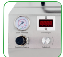
PRESSURE CONTROL, DRY ICE CONSUMPTION CONTROL