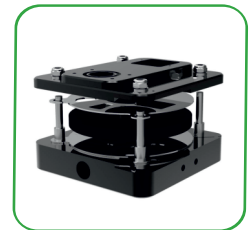
PATENTED FEEDING SYSTEM

7 m BLAST HOSE 3/4" WITH ANTI - KINK SPRING HOSE GUARD