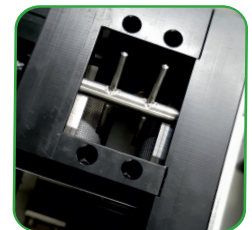
ANTI - CLOGGING SYSTEM