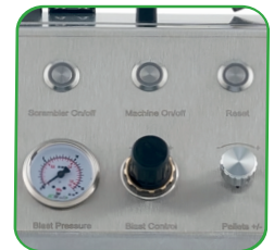
PRESSURE CONTROL, DRY ICE CONSUMPTION CONTROL