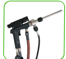
SPECIAL ABRASION RESISTANT NOZZLE