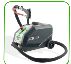
COMPATIBLE WITH IC 022 EVO