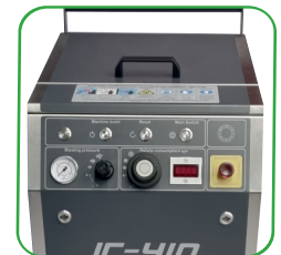
USER FRIENDLY CONTROL PANEL