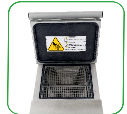
INSULATED HOPPER (31 KG CAPACITY)