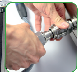
STAINLESS STEEL QUICK CONNECT